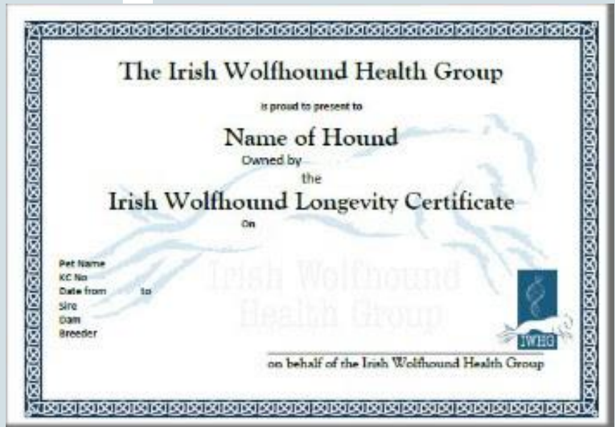
Super-Veteran Jasmine lifespan 11yrs 11mths

When submitting your application to join the IWHG Longevity Recognition Programme, a photo of your venerable hound to add to our roll of honour, would be very welcome.