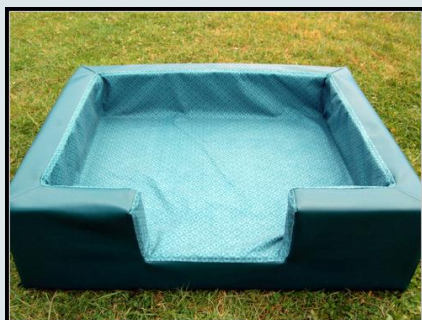
£66y Bed, size 3, in SoftDog and MarDog