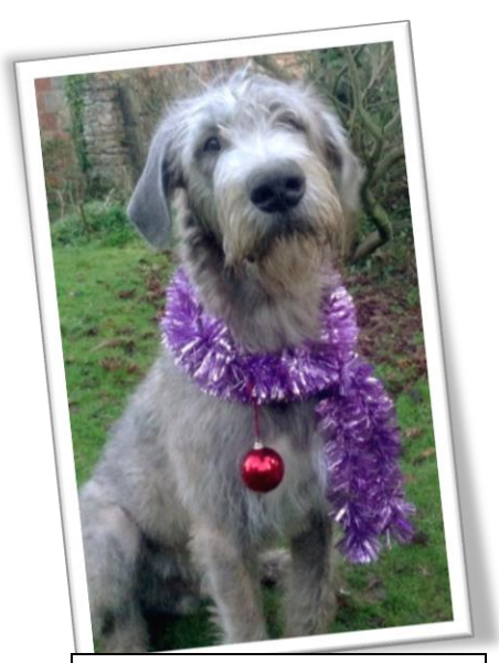
'Nimbus' an example of successful corrective shunt procedure

Luckily within the UK we have had some great success stories from Irish Wolfhounds that have been operated on. The majority have been operated on in a timely manner and with few or no other secondary issues diagnosed at the time of the operation. The timescale for making the decision to operate on the shunt is short; with the liver not functioning normally the toxins will build up and impact on other organs.