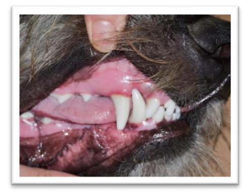
8 months Lower canine now pressing outside gum

We are liaising with a canine orthodontist, who has an interest in the differential growth rates in giant breeds, when compared to what is